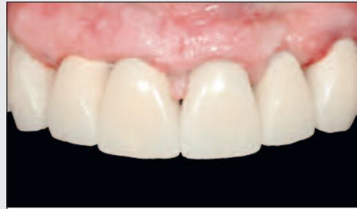
Fig 7 Intraoral view of temporary implant abutments customized with light-cure composite.