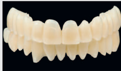
Fig 8 Full-mouth provisional restorations were placed immediately after insertion of the implants.