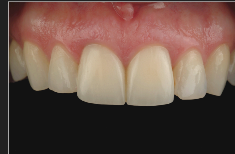
realcase -provisional course _2015_